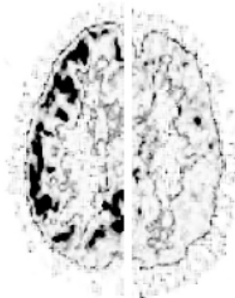
Figure 1: Composite of Two Human Brains Demonstrating High 5-HT 2A Receptor Occupancy of ACP-103

Figure 1 is a composite of PET images of two human brains. The left half of the figure is from a subject given placebo, and the right half of the figure is from a subject given a single five milligram dose of ACP-103 that yields an estimated plasma drug level of approximately three nanograms per milliliter. This dose leads to significant occupancy of 5-HT 2A receptors in the neocortex of the brain. Darker regions in the neocortex on the left half of the image show the PET-labeled 5-HT 2A receptors. These receptors are not visible on the right because they are being blocked, or occupied, by ACP-103 treatment. Based on these PET data and the results of our Phase I and Phase Ib/IIa clinical trials, we believe that low doses of ACP-103 will be sufficient to demonstrate efficacy in our clinical trials.